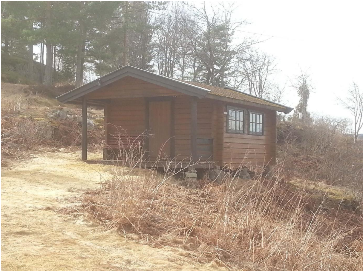
Cabin, Natvedt camping